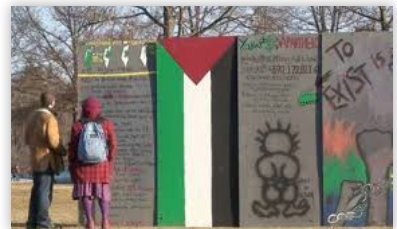
Anti-Israel "Apartheid Wall" display, which is taken to North American college campuses.

While BDS has made inroads in Europe, the most important battlegrounds today are in the U.S. (and Canada), where BDS has launched a multi-pronged attack.