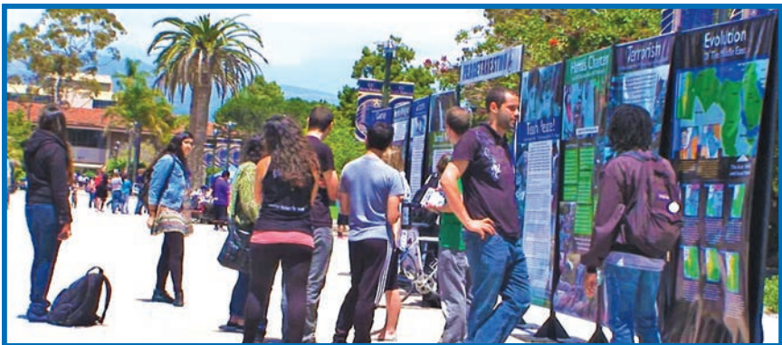
StandWithUs "Israel Matters" Display, which travels to North American college campuses to educate students about Israel.

Finally, we must defeat the bigoted BDS movement through legal means. States like South Carolina and Illinois have already moved in this direction.